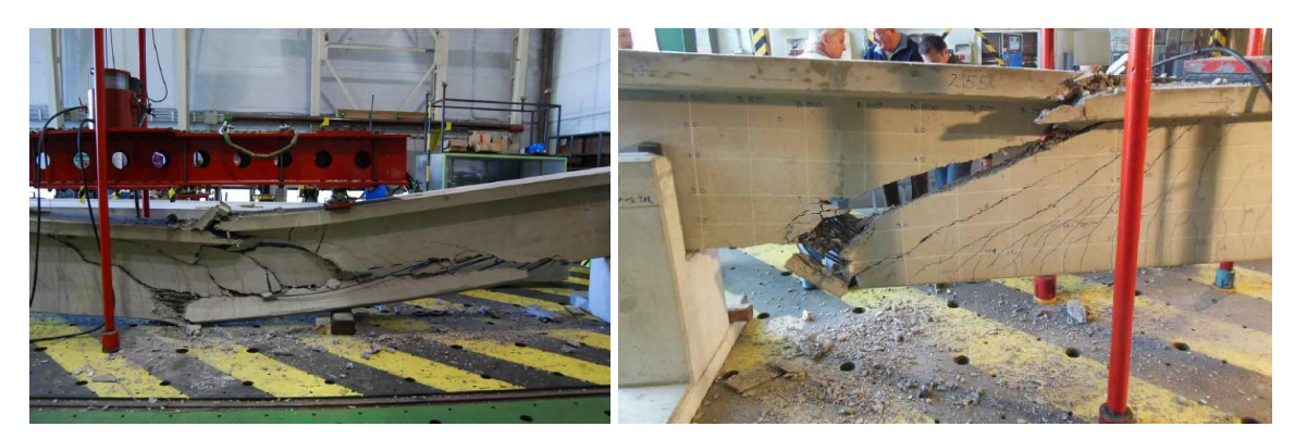
Fig. 3 Bending (left) and shear (right) failure

cracks went from the support to the load, the firsts' inclination was 35-45°, and the last was 18°. Failure was ductile in cases of both steel and synthetic fibres.