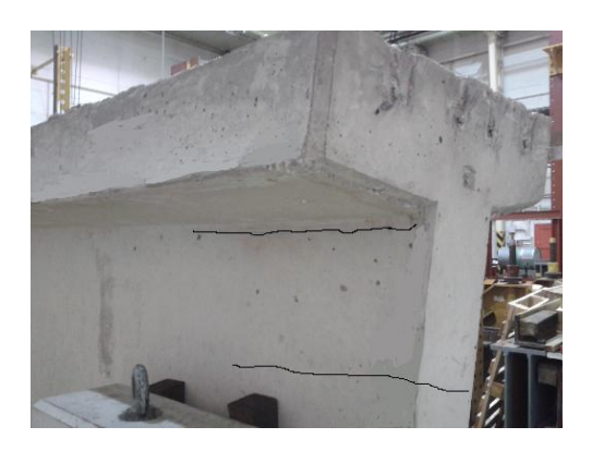
Fig. 1 Spalling crack in the end of the beam